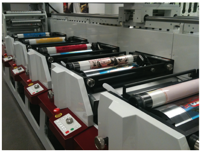
"The iQ Automation Platform and MR-J4B-RJ Servo System from Mitsubishi Electric improved our tension control by 500%, with more accurate registration and less servo following error than other systems we have tested."

The search started with a field of 15+ potential suppliers which was quickly narrowed to a short list of just 5 leading controls vendors using a decision matrix and a cost analysis. In addition to overall system performance, commonality of development tools, training, service, local and worldwide support were key criteria in choosing a controls platform.