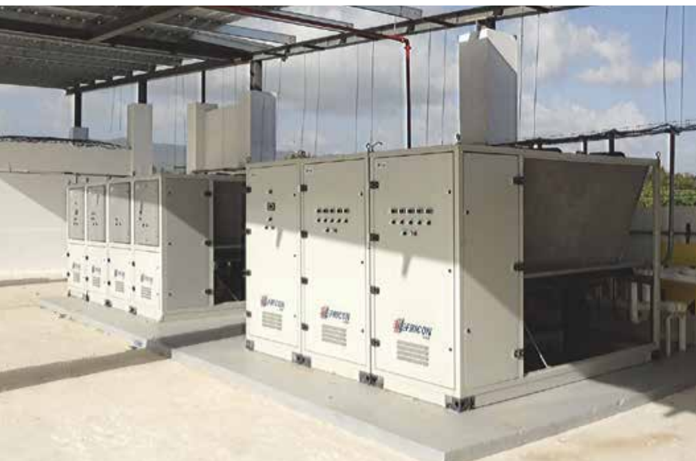
Modular parallel compressor rack units eliminate the need for mechanical rooms.

In late 2016, FriconUSA established a partnership with low-voltage manufacturer NOARK Electric. NOARK is a rather recent player in the U.S. industrial automation market with UL certified components, and an industry