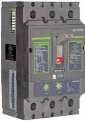
NOARK UL489 M2N series Molded Case Circuit Breaker